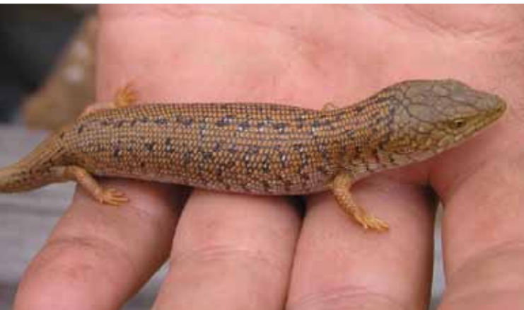
Adult Pygmy Bluetongue Lizard

The Pygmy Bluetongue Lizard ( Tiliqua adelaidensis ) had been considered to be extinct until the discovery of a wild population in Burra in 1992. Prior to this only 20 specimens had ever been found and no wild populations were known.