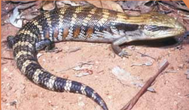
Juveniles of the much larger Eastern Bluetongues ( Tiliqua scincoides ) have cross-bands on the body and tail.

Other lizard species, such as the ones pictured below, can be confused with Pygmy Bluetongues.