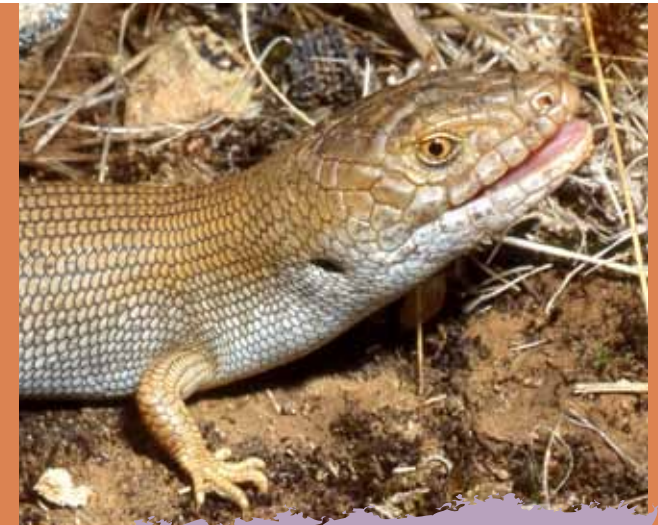
Pygmy Bluetongue Lizard Tiliqua adelaidensis

PHOTO CREDITS: Aaron Fenner, Mark Hutchinson, Peter Robertson, Julie Schofield and Nature Foundation SA