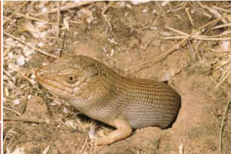
The holes of the Trapdoor spider ( Blakistonia ) are favoured by Pygmy Bluetongue Lizards