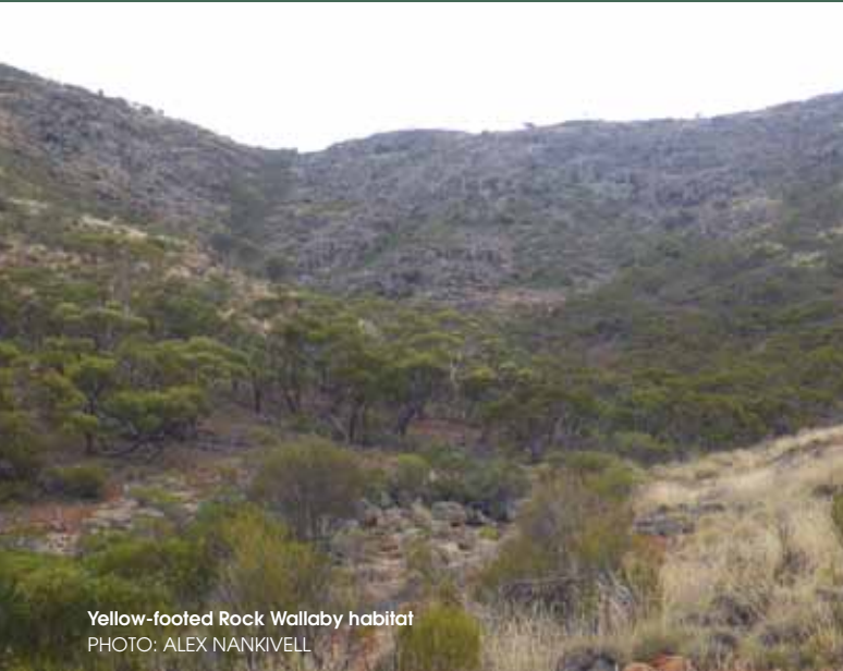
Yellow-footed Rock Wallaby habitat

In early April, NFSA launched the Warren Bonython and Betty and Bob Lewis Walking Trails to the public. Members from the Bonython and Lewis family, members, NFSA Council and the public attended the launch of two stunningly picturesque Walking Trails. Fantastic weather meant that all who attended had the opportunity to complete the trails and enjoy the exceptional views from the top of Mt Hiltaba.