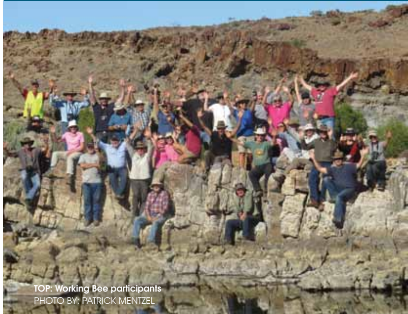
TOP: Working Bee participants

The 2015 Grand Working Bee was held at Witchelina 30 April – 3 May, with 44 enthusiastic volunteers turning the property into a hive of activity for the 4 day duration. The weather was pleasantly warm, mid 20's days provided the perfect climate for working in the South Australian outback.