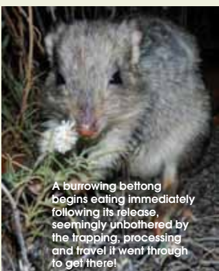
A burrowing bettong begins eating immediately following its release, seemingly unbothered by the trapping, processing and travel it went through to get there!

"Being able to release an animal from a semi-captive environment into the wild is such a rewarding experience and something that not many people get the opportunity to do in their lifetime, it's a memory I will treasure forever."