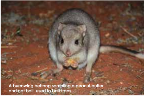
A burrowing bettong sampling a peanut butter and oat ball, used to bait traps.